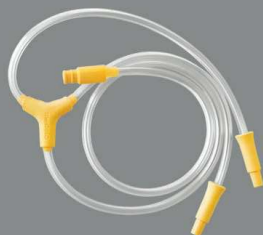
1 x tubing