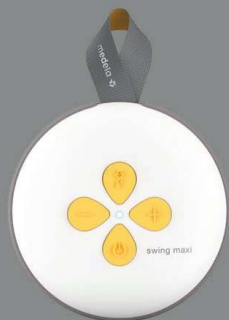
1x Swing Maxi™ pump unit