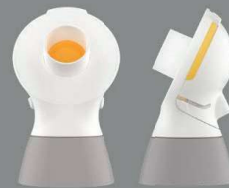
2 x PersonalFit Flex™ connectors