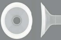
2 x PersonalFit Flex™ breast shields 24 mm