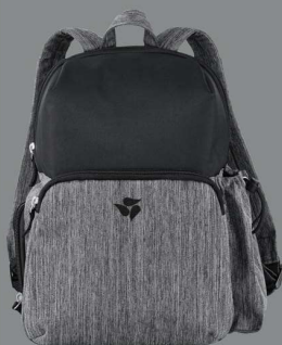
1 x Microfiber carry bag