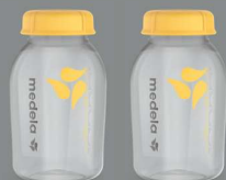
2 x 150 mL bottles with lids